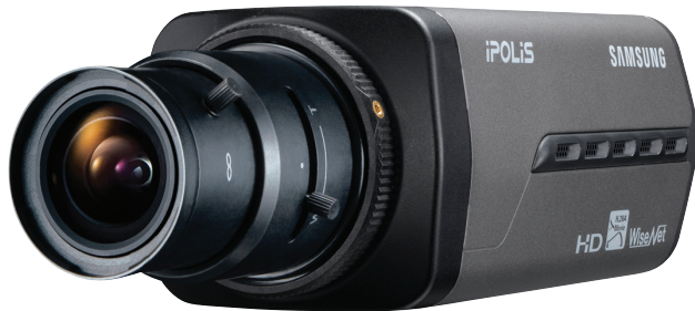
Lens not included